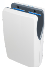
AA24050 8427950360596 White finish