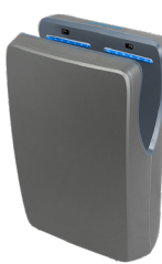
AA24950 8427950360626 Graphite finish