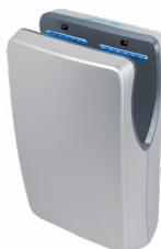
AA24550 8427950360602 Silver finish