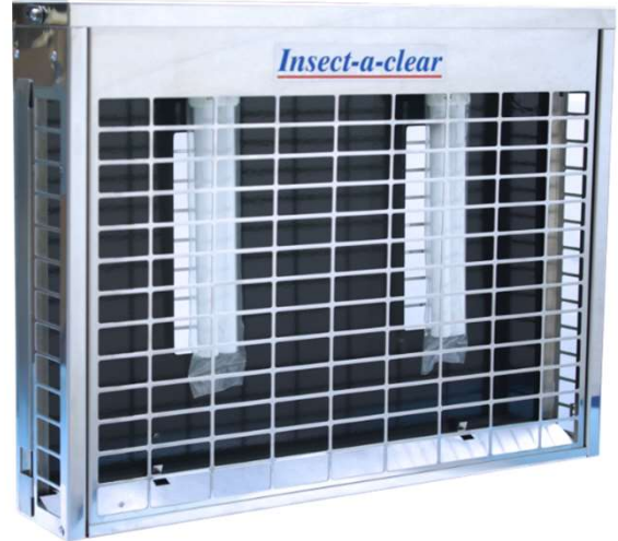
Actual size W 51 x H 38 x D 9.5 cm

With its unique 'thru board light technology' all the lamps can be seen from both sides of the machine, thus giving maximum attraction to flying insects.