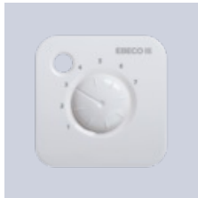
Täckfront EB- Therm 55